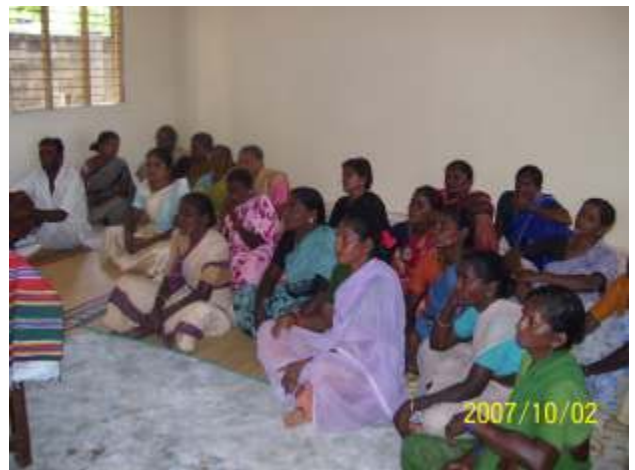
Meeting at Kutchur / fr# hpy; $ I I k