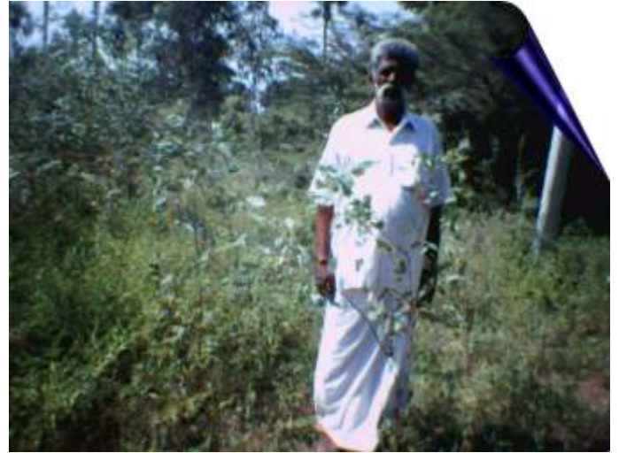
Mullaippoo Small Group of Placepalayam gñNs] ;ghi saji j r;rhHej Kyi ygG+rpWFO