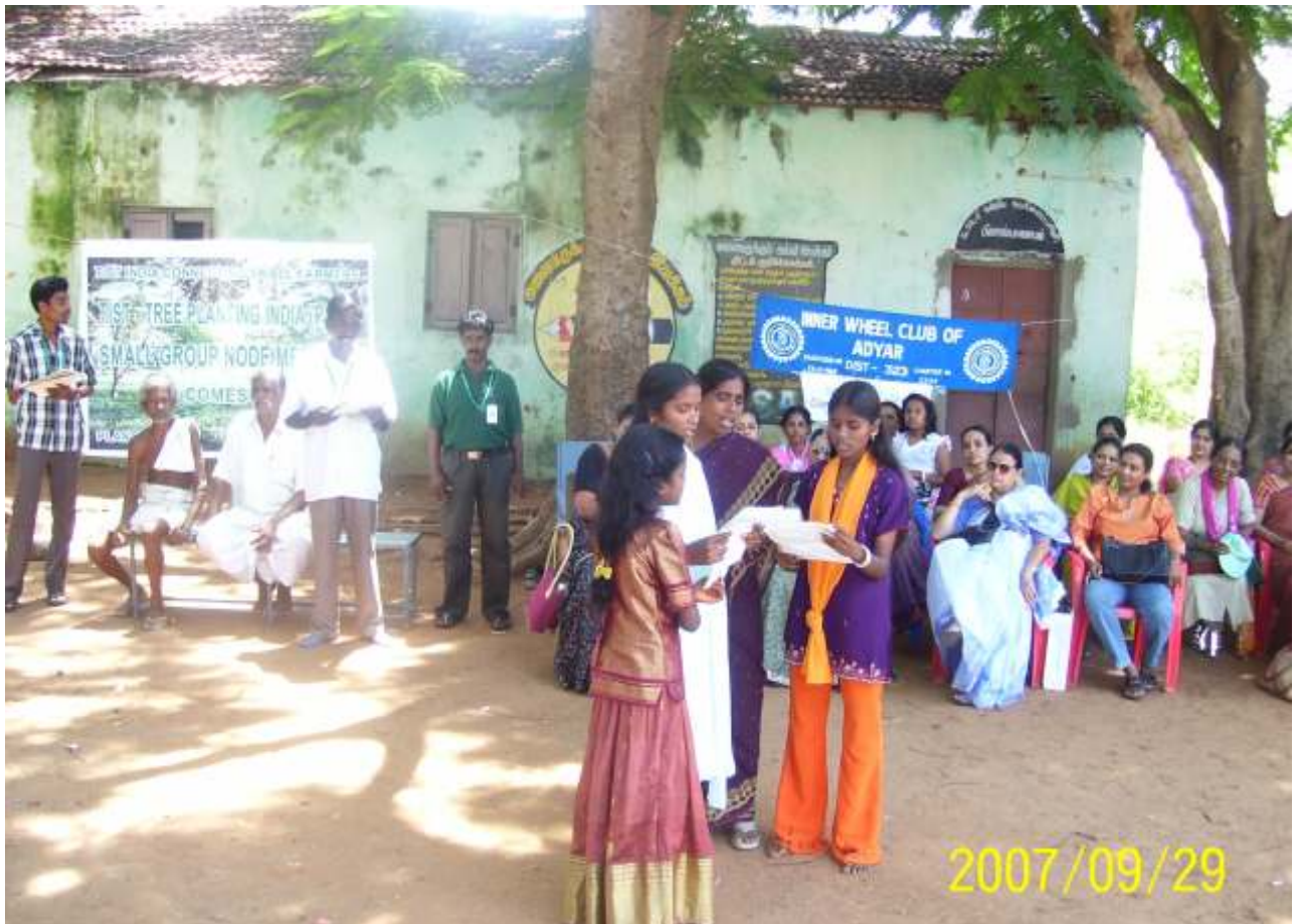
Oh elder brother! elder brother / mz Nz mz Nz coth mz Nz