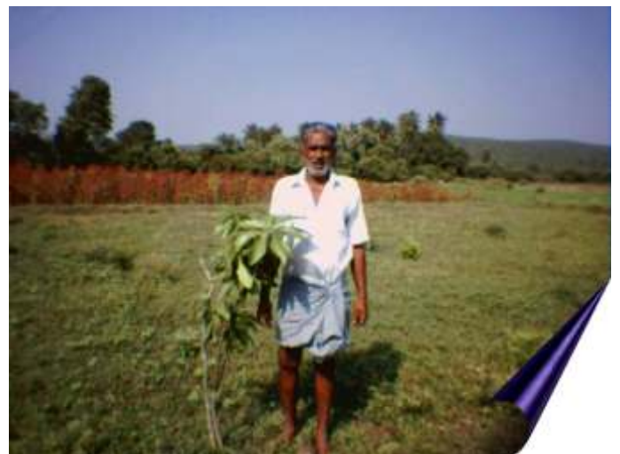
Mullaippoo Small Group of Placepalayam gñNs] ;ghi saji j r;rhHej Kyi ygG+rpWFO