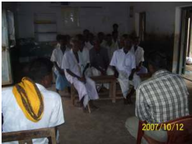
Meeting at Ulundhai / cS ei j a py; $ I I k;

cS ei j f p u h k k f f s; N f I L n f h z ; j p d N g h y; b ] I ; , e j p a h c S e i j a p y; x U $ I I k; e l j j p a J . c S e i j f p u h k k f f s; b ] I ; n r a y g h L f s; g f f j J f p u h k q f s p y; e l g g i j c d d p g g h f f t d r j J n f h z ; L k; g f f J C h p y; c s s m t H f s J e z g H f s; k w W k; c w t p d H f s; b ] I ; g z k; t o q f y; u r U n g W t i j f z ; $ I h f g h H j ; J n f h z ; L k; , U e j p U f f p w h H f s; , g N g h J > b ] I ; n r a y g h l b y; N r U t j w F , e j f p u h k j j h H f s; $ I M H t K l d; , U f f p w h H f s; m f N I h g H 12 > 2007 m d W c S e i j f p u h k j j p y; c S e i j g Q; r h a j ; J j i y t u h y; j q f s J f p u h k g g s s p a p y; x U $ I I k; e l j j g g l I J . b ] I b d; m i d j ; J n r a y f i s A K; m w p e ; J m e j f p u h k j j h H f s; k f p o N t h L , U e j h H f s; t p i u t p y; b ] I ; r p W F O t p y; N r u c W j p m s o j j d H .