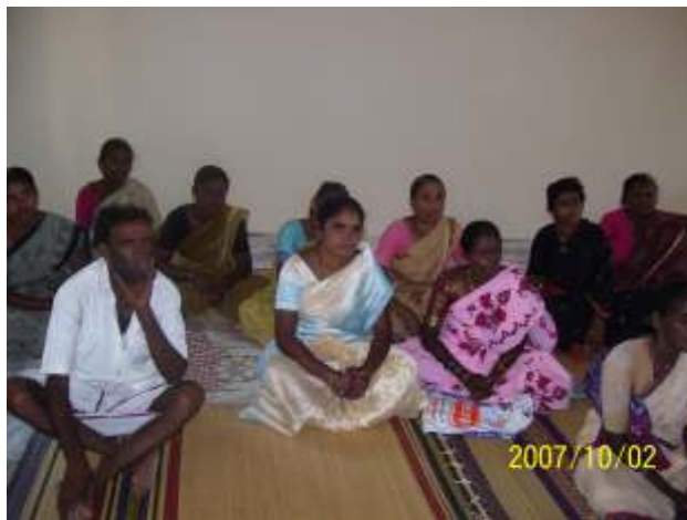
Meeting at Kutchur / fr# hpy; $ I I k

b] I ; mfNI hgH 5k; Nj j p 2007 y; j dJ $ I I j j j fr# hpy; $ I baJ > fr# H > C j ; j fNfhI ; I apypUe; J 6 f.p.kP nj hi ytpy; j pUts; @H nry; Yk; topay; css xU rpWfpuhkk; mej $ I I j j j py; 10 rpW FO; f; s; py; Ue; J 22f; Fk; mj pfkhd ngz ; cWggpdHfs; gqNfwwdH. mthfs; fpAI NI h> GNuhl I hfhy; fhHgd; t; pahghuk; kwWk; b] I ; , ej pa nrayghLfs; gwwp ed; F nj hpe; J nfhz I hHfs; fr# H gFj p cWggpdHfs; j qf; s; epyq; f; s; py; kpfTk; fbdNti ynra; J nfhz bUf; f; pwhHfs; Vnd dpy; mthfs; epyk; fbdkhd ghwhq; fy; kwWk; $ ohq; f; wfi s ci I aj ha; , Uf; f; pwJ.