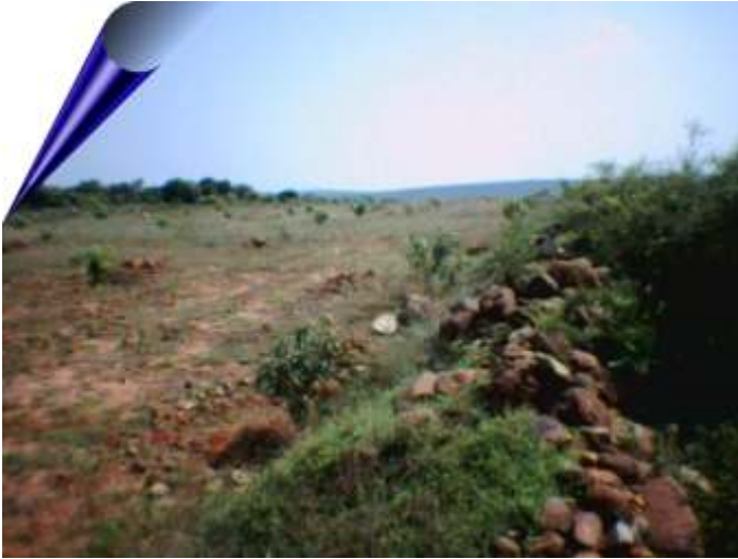
Mullaippoo Small Group of Placepalayam gñNs] ;ghi saji j r;rhHej Kyi ygG+rpWFO