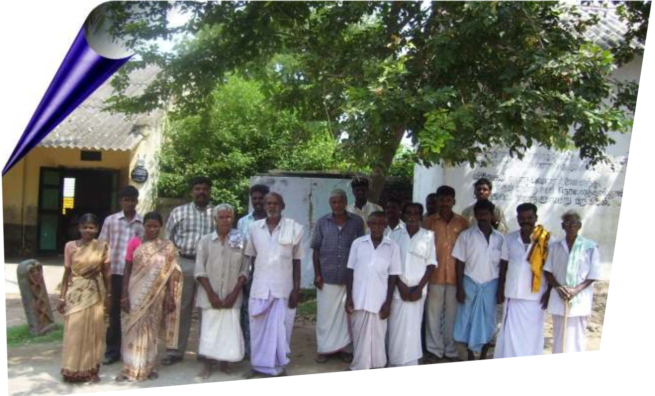
Meeting at Ulundhai

TIST India had a meeting at Ulundhai as requested by the villagers of Ulundhai village. Villagers from Ulundhai have been watching the TIST activities in their neighboring villagers and they have witnessed the TIST voucher payments received by their friends and relatives in their neighboring village. Now, these villagers are also interested to join in TIST activity. On 12th October 2007, there was meeting at the Ulundhai village, organized by the Ulundhai Village Panchayat Head at their village school. The villagers were happy to know all the activities of TIST. The villagers promised to join in TIST Small Group very soon.