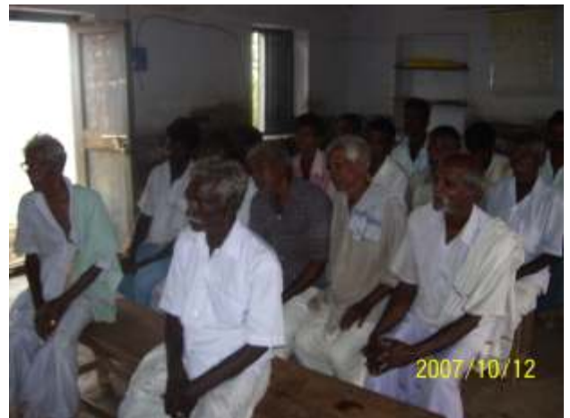
Meeting at Ulundhai / cS ei j a py; $ I I k;