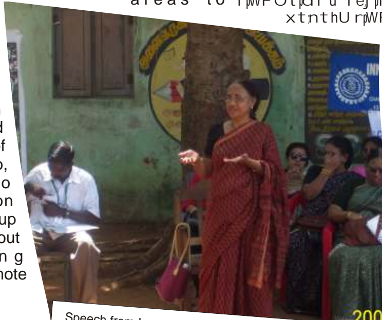
Speech from Innerwheel / , d dHtly; f;psg; ji yth nrhwnghopt

MtHfs; j hq;fs; b] ; j pl ; gFj p;f;sp; css r;WFOt;pd i u rej p;f;fTk> j q;fsJ f;psg; rhHgry; xtntH U r;WFOtk; Fi wej J xdW myyJ , uz ;L kuf;fd;Wfi s nfhLggj pd; %yk; el ;L tshf;f CffggLj j Tk; xU R;W;Wyht hf te; j j hf nj hpt; j j hHfs;. NKYk; r;WFO cWggpd HFNshL fye;Ji uahb xJ f;F;g;Gw kw;Wk; t rj papy; yhj f;phkq;f;sp; mtHfs; thOk; epi yg; gw;wp fz ;l wpa t; pUk;gd hHfs;