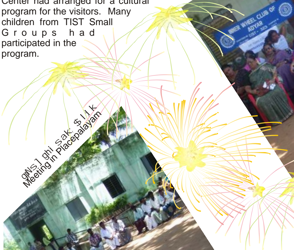
gNs] ghi sak; $!ik Meeting in Placepalayam