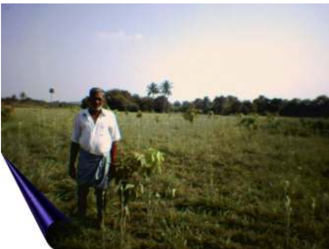
Mullaippoo Small Group of Placepalayam gñNs] ;ghi saji j r;rhHej Kyi ygG+rpWFO

, ej rpWFO b] l; cl d; MWkhj qfS f;F Nkyhf , UeJ tUfµJ. mth j qfsJ kuqfi s gñNs] ; ghi sak; fpuhkj j py; el;Ls;shHfs; mthfsJ fZ i kak; gñNs] ;ghi sakhFk; mfNI hgH 15> 2007y; el ej fz fnfLggpd; NghJ> , ej rpWFOthd 4 nttNtW , dkuqfshd> Nj f;F> kh> nfha;ah> A;fhtµl ] ; vd vyyhk; nkhj j khf 1178 kuqfs; ngwµUej J. , j d; cWggpdHfs; kh> A;fyµl ] ; kw;Wk; NtW rpy , ej µa , d kuqfs; vyyhk; nkhj j khf 1730 MFk; 4 nttNtW , dkuqfi s nfhz ;l xU ehwwhq;fhi y $ l i t j J s shHfs; , ej rpW FO cWggpdHfs; gñNs] ; ghi saji j py; el f;Fk; mi dj J $ l j qfs;µYk; fye;J nfhs;fµd;whHfs; mj dhy;gñNs] ; ghi saji j py; css mi dj J cWggpdHfi sAk; mej $ l j j py;fye;J nfhs; nraa cWj µaha;cssdH.