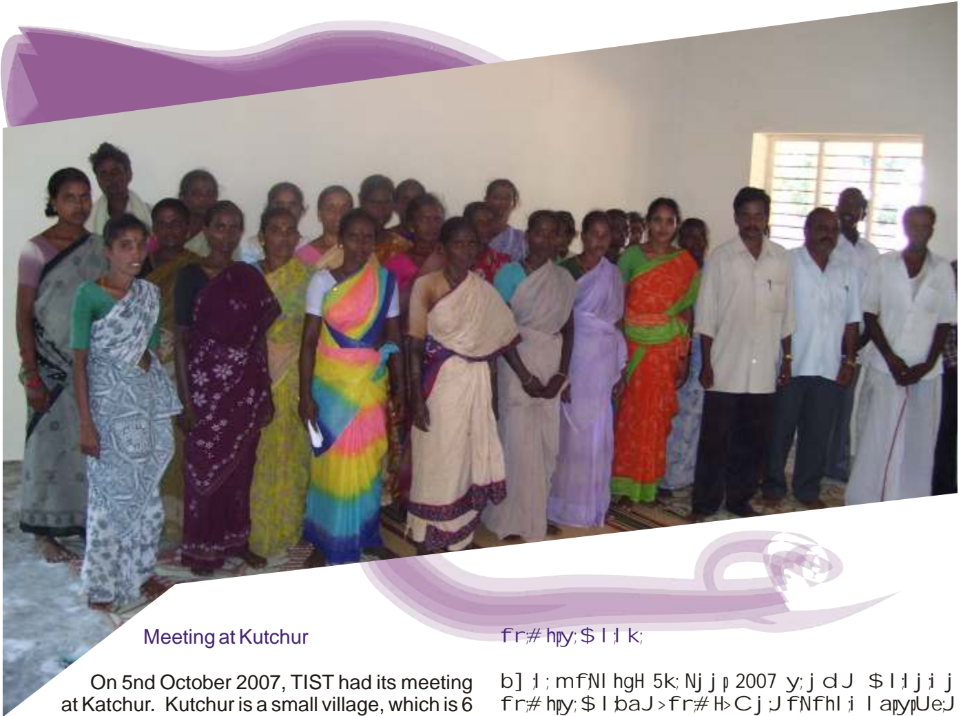
Meeting at Kutchur