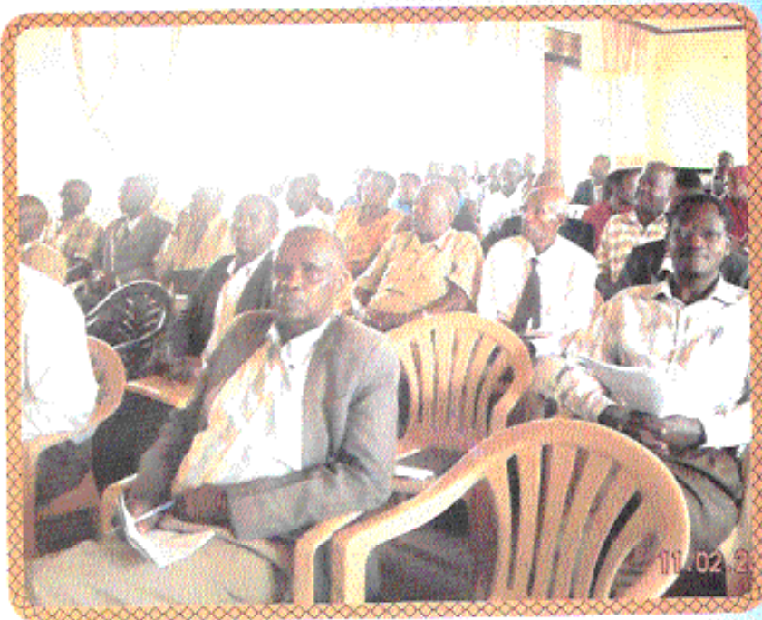
Stakeholders meeting at mothers union Katungu Bushenyi