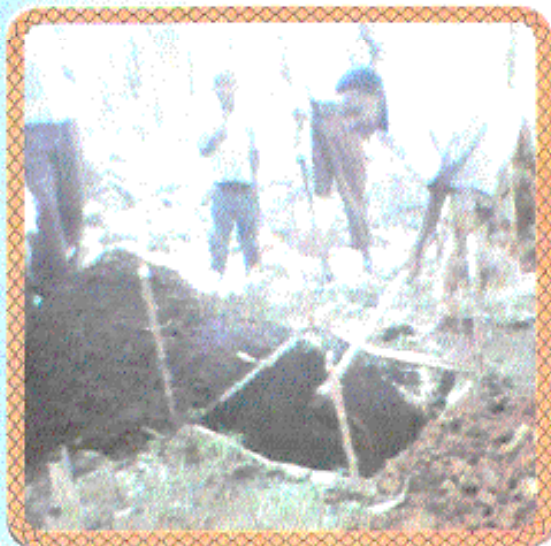
TIST SG members practicing conservation framing in Kyangyenyi