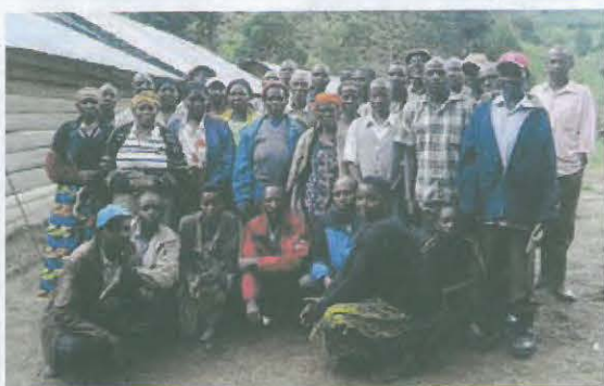
A small group of members after cluster meeting in Kinaba-Kanungu District