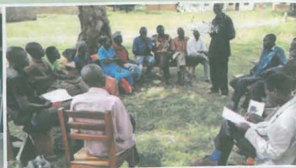
Small group members during their weekly meeting in Gulu District