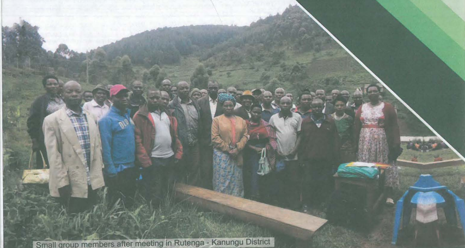
Small group members after meeting in Rutenga - Kanungu District

Katungu Hill, Bushenyi Town, P.O.Box 232, Bushenyi, Tel: +256 773 716 960, www.tist.org