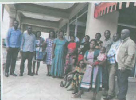
Green team members after a meeting in Rukungiri District