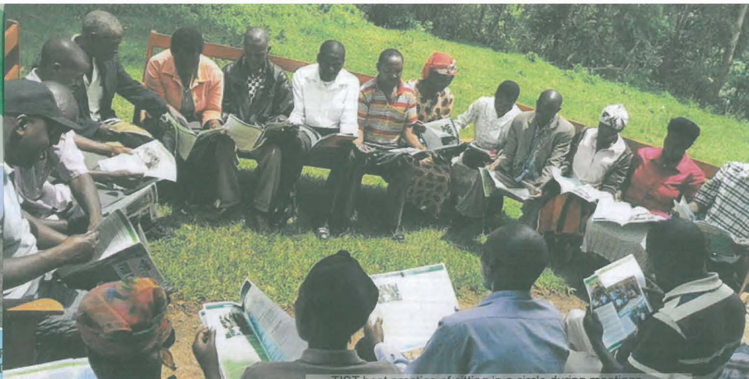
TIST best practice of sitting in a circle during meetings