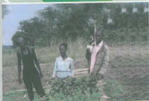
Raised seed bed in Kayunga District is one of the best methods of preventing roots from penetrating the soil