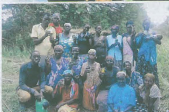
Gender equality in TIST, women can also participate in tree planting & be a group member