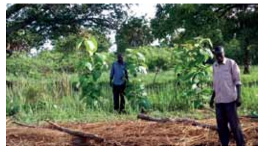
Locating boundaries by members during quantification Gulu

The TREE is a monthly newsletter Published by TIST Uganda, a project area of The International Small Group and Tree Planting Program .