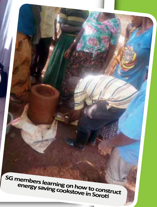
SG members learning on how to construct energy saving cookstove in Soroti