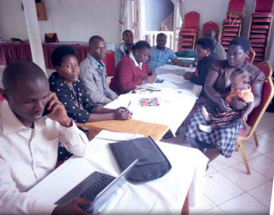
Kanungu quantifiers in group work during training workshop in Kabale