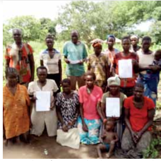
SG members after signing the GhG contract in Gulu