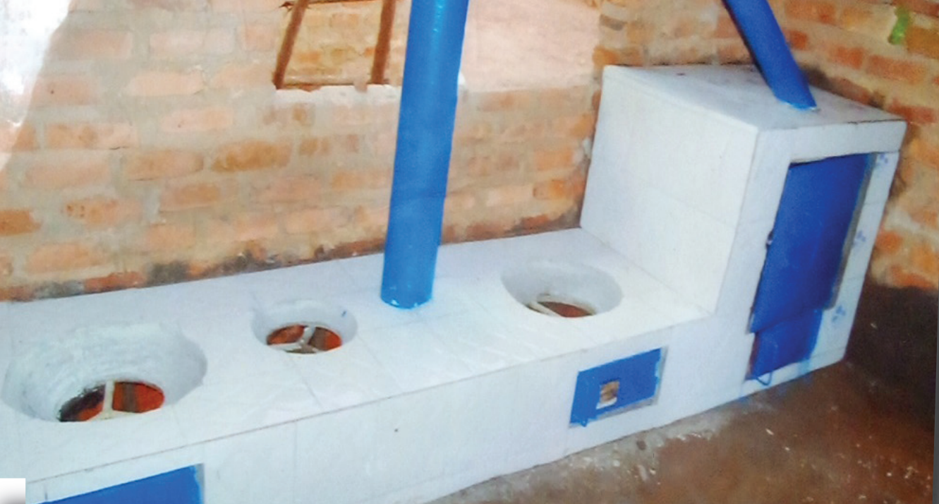
Energy saving cookstove that reduce smoke in the Kitchen