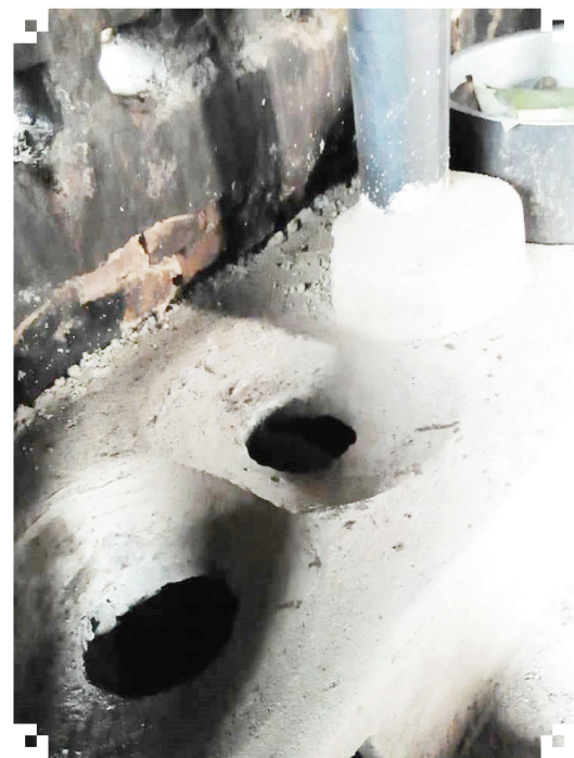
Energy saving cookstove with a smoke chimney to direct the smoke outside the kitchen

The TREE is a monthly newsletter Published by TIST Uganda, a project area of The International Small Group and Tree Planting Program .