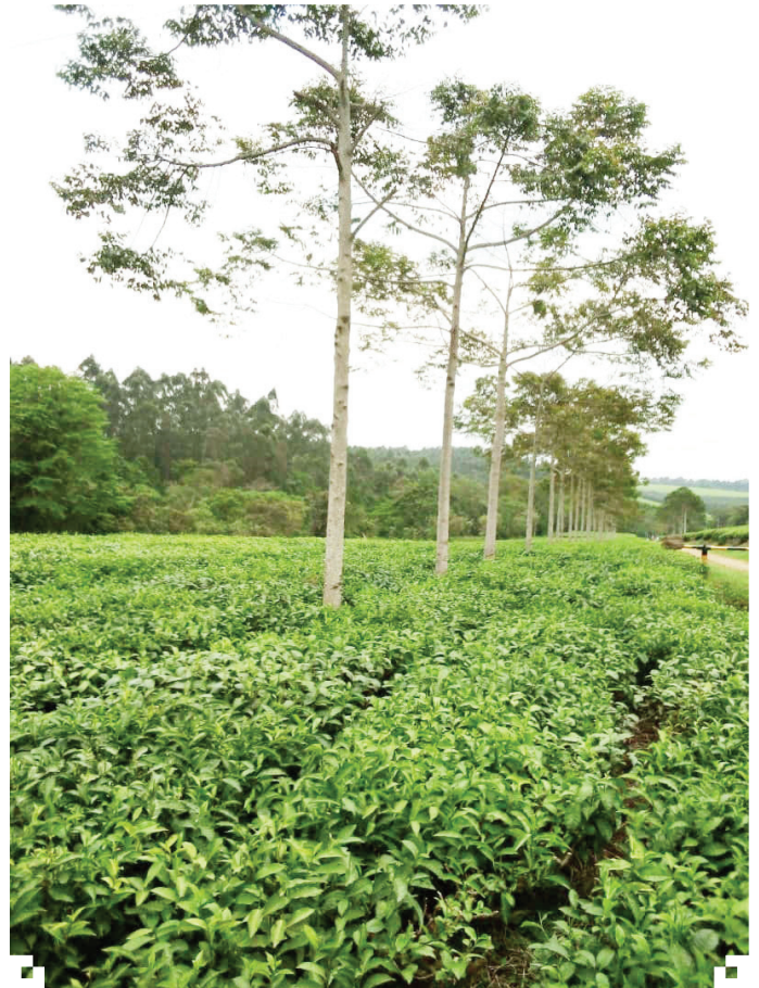
Boundary Planting in Tea Plantation for Omusizi