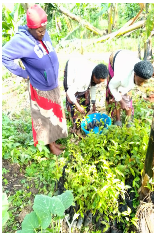
SG members represented by women in Nyamiko -Kiyanga are receiving seedlings after a sensitization meeting

The TREE is a monthly newsletter Published by TIST Uganda, a project area of The International Small Group and Tree Planting Program .