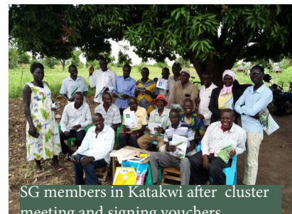
SG members in Katakwi after cluster meeting and signing vouchers.

Wan weng wakeme ki tio timo tic maber, pyen kare ma ber bi bino ci wakayo ka inen pe wa jalo woko. Ci dong ba kit madong wa tyeki ka kare makere tutwali, watim gin ma ber bot dano weng dok bot ngat acel acel tut wale bot jo ma gin tye l dok paco pa jo Pa Rubanga (Luyeyo) (jo Glatiya 6:9-10)