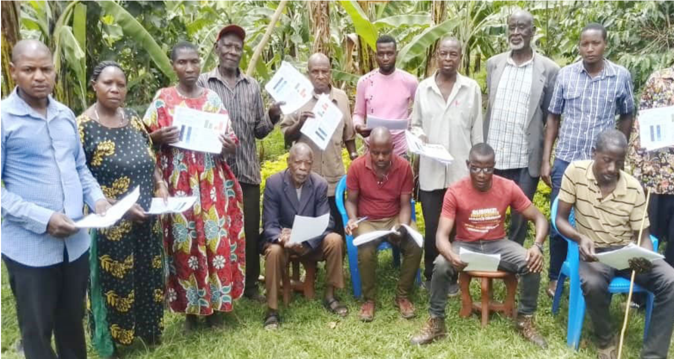
Kyaruganda cluster members after signing vouchers during the cluster meeting